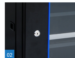
小圆锁, 可选 Small round lock is optional