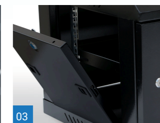
可拆卸侧面门, 使用灵活 Removable side door, flexible use