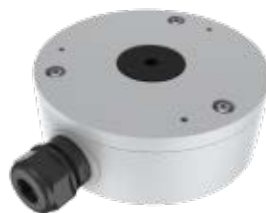
TC-P54BM SPEC: V5 JUNCTION BOX