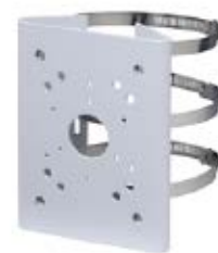
A36 POLE MOUNT