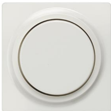
DELTA i-system titanium white Cover plate for dimmer with rotary knob 55x 55 mm